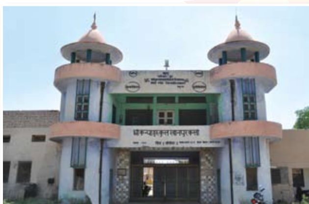
The Main Gate of Kanya Gurukul

The State Government of Haryana upgraded the erstwhile Gurukul to the status of a University exclusively for women in August 2006 and christened it as Bhagat Phool Singh Mahila Vishwavidyalaya, which happens to be the first State Women University of North India. Since then BPSMV has undergone a complete transformation; a 79 years old Gurukul started with just three girls has turned into a modern university with approximately 7000 girls on its rolls studying in various job oriented programmes from KG to Ph.D. level. The university has established its two Regional Centres at Kharal (Jind) and Lulla Ahir (Rewari).