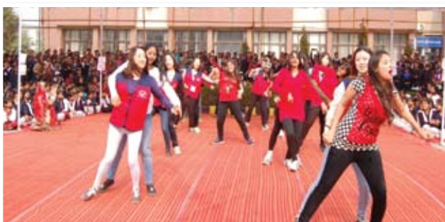
BPSMV Students dancing with their South Korean counterparts