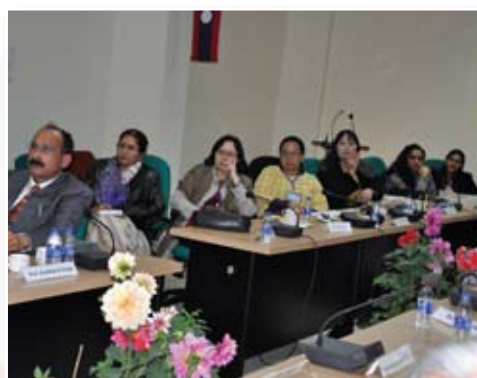
Second International Conference on South East-East Asia