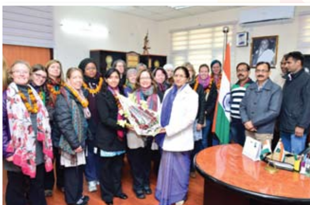
Foreign delegates from St. Catherine University, USA interacting with the Hon'ble VC, BPSMV