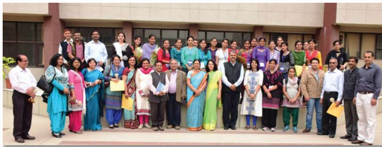
Delegates of the International Conference organised by the Department of English