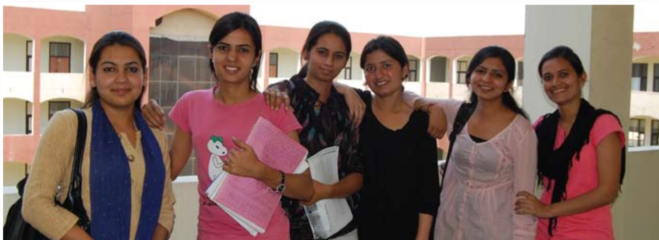
CSE & IT students