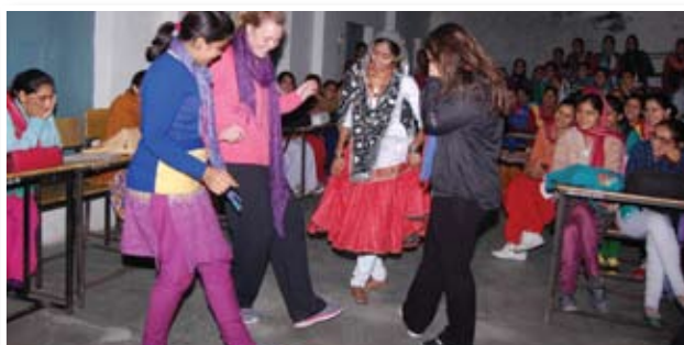
BPSIHL Students teaching Haryanvi Dance Steps to the American Interns