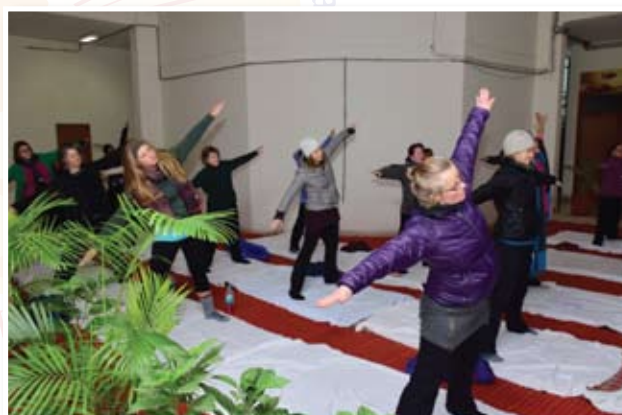
Yoga Session for Catherine University Students organised on the University Campus at Khanpur Kalan