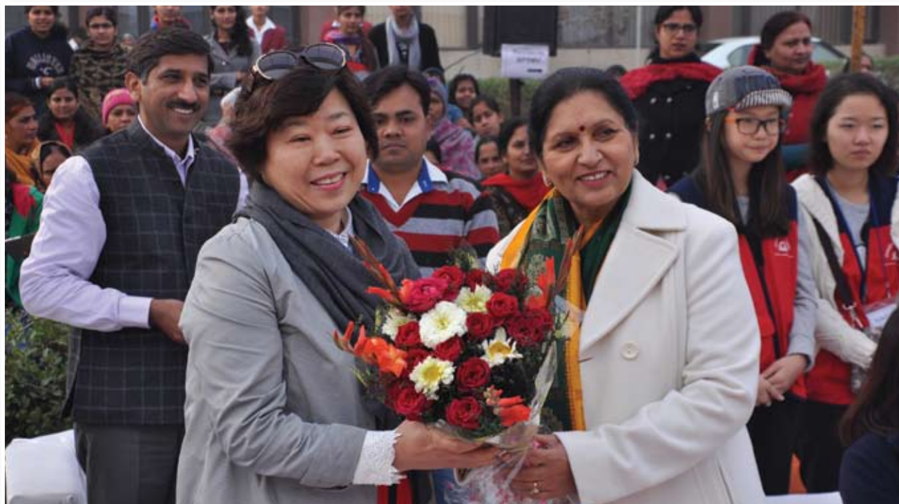
Hon'ble VC, BPSMV Welcoming the Team Leader from Kwangwoon University, South Korea