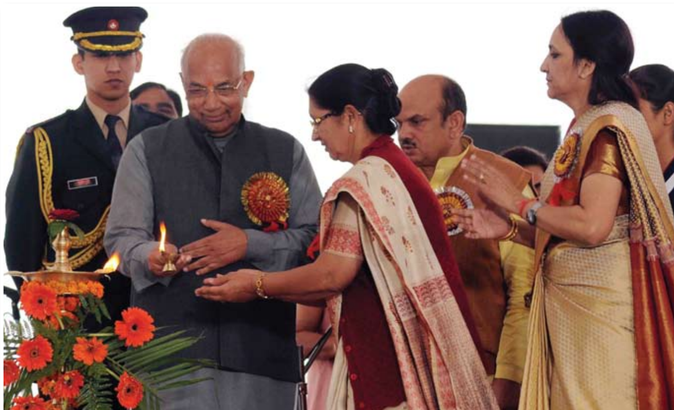
Prof. Kaptan Singh Solanki, Hon'ble Governor of Haryana and Sh. Ramesh Kaushik, Member of Parliament, inaugurating the University Youth Festival held on 27th November, 2014