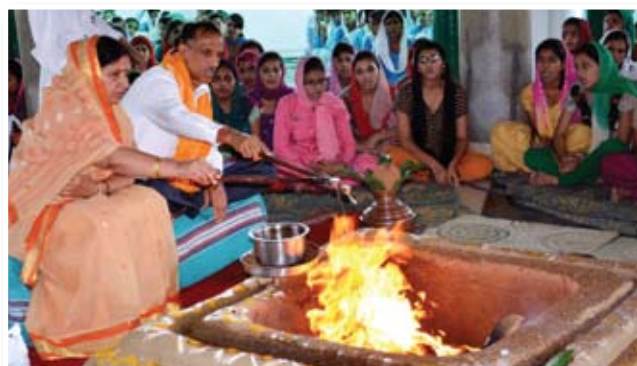
Promoting Indian Values